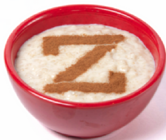
Abuela's Creamy Oatmeal

Two eggs served with Palomilla steak & roasted potatoes.