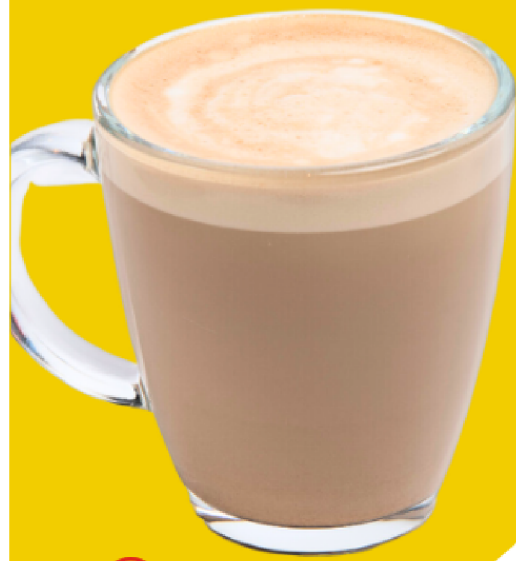
Z Café con Leche