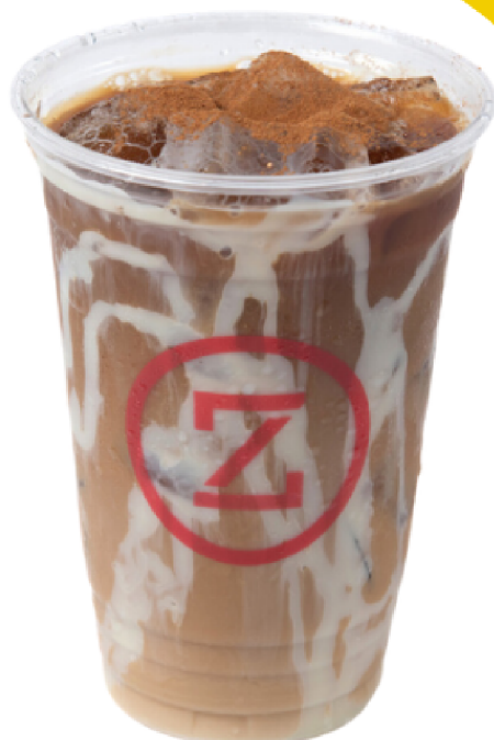
Z Cafresco Cold Brew

Zaza Cold Brew, infused with a wholesome blend of sugarcane almibar, cinnamon, & milk.