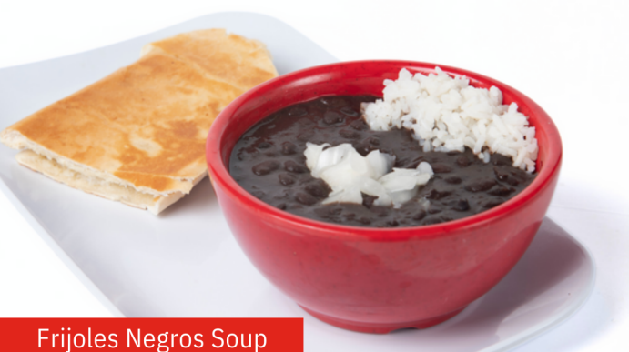
Frijoles Negros Soup

Frijoles Negros 5.00 Black beans simmered with fresh herbs & spices, served over white rice & topped with diced onions.