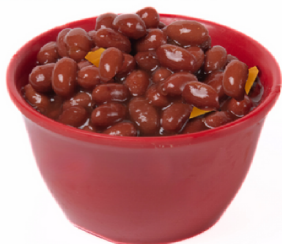
Red Beans & Calabaza

Roasted Potatoes White Rice Maduros Fried sweet plantains. Roasted Vegetables