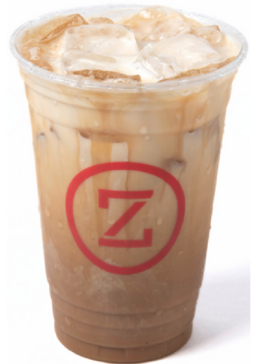
Z Iced Café con Leche