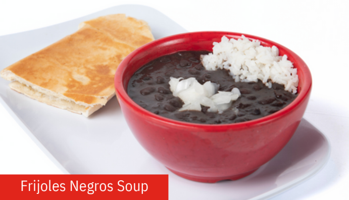
Frijoles Negros Soup