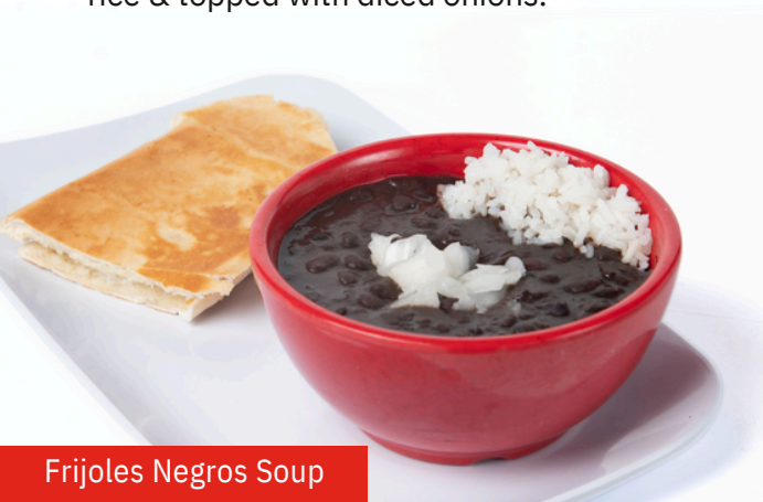
Frijoles Negros Soup

Black beans simmered with fresh herbs & spices, served over white rice & topped with diced onions.